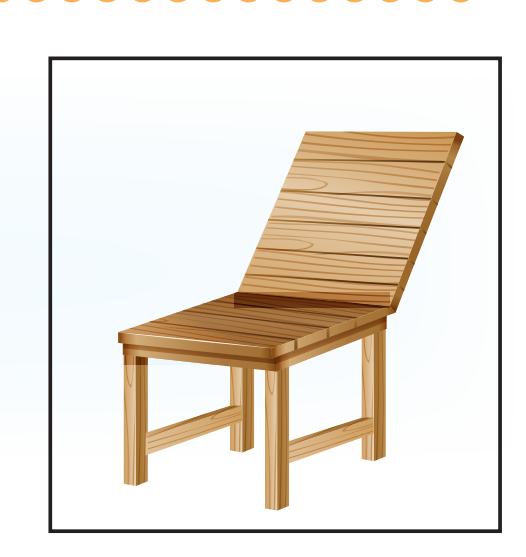
Answer key worksheet